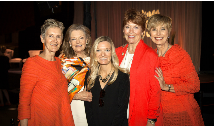
2016 Women for OSU Symposium